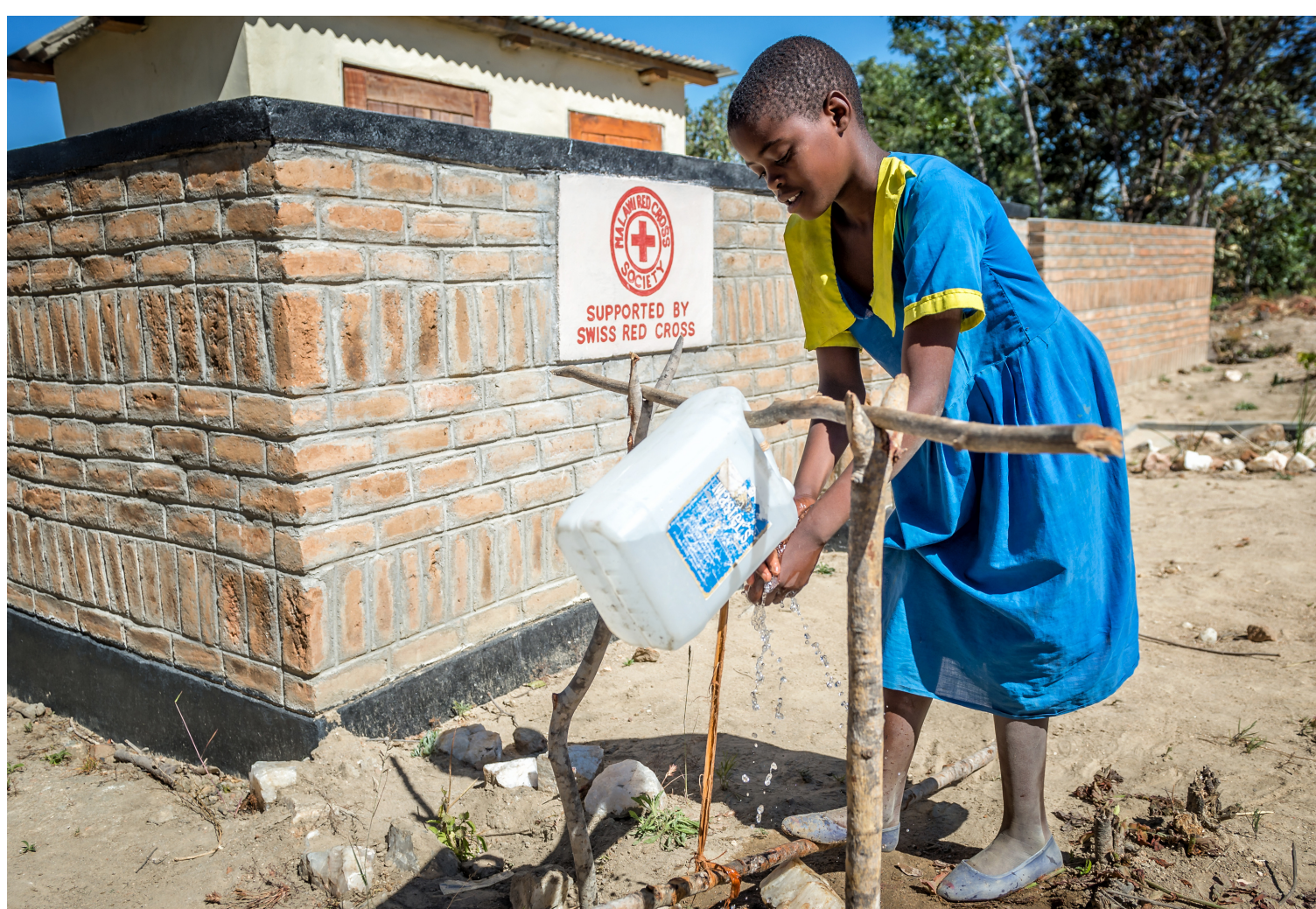
Malawi Red Cross