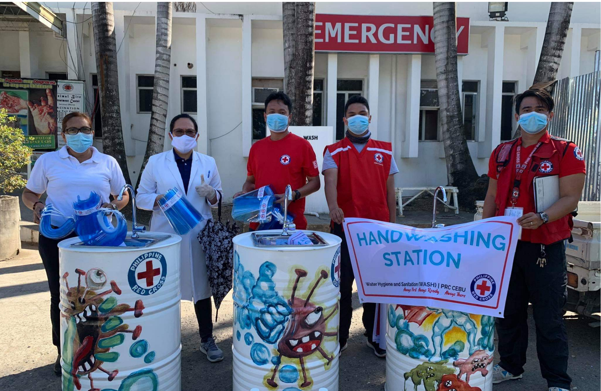
Philippines Red Cross