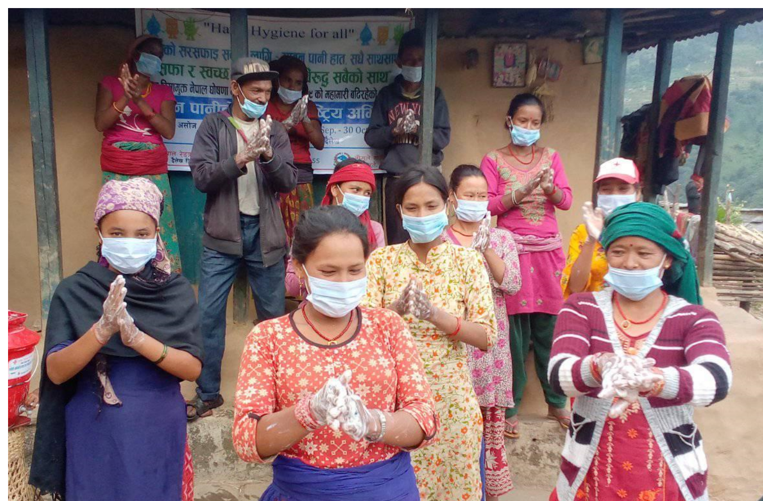
Nepal Red Cross