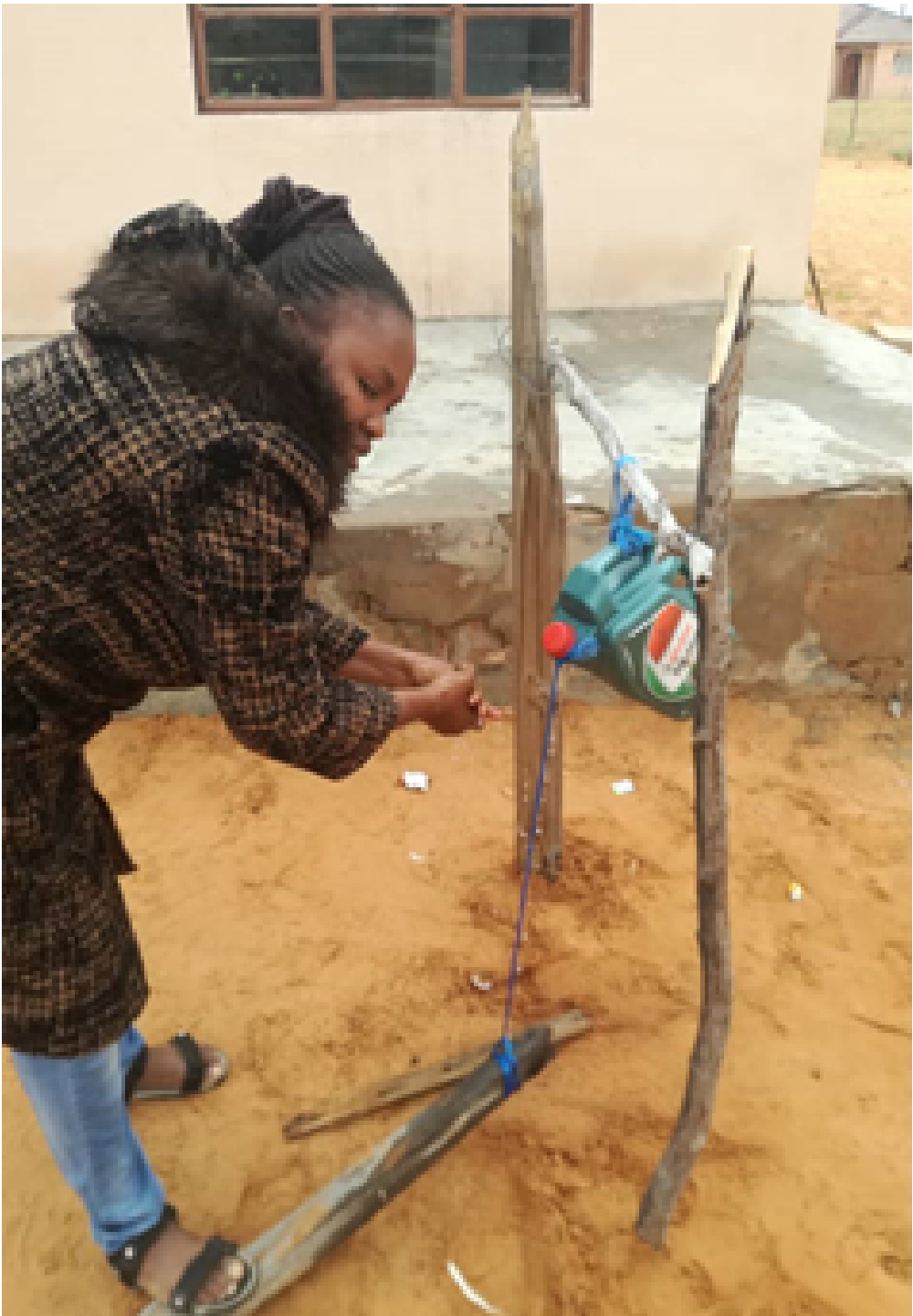
Botswana Red Cross

□ Reimagining hand hygiene in society means leaving no one behind and bringing communities to the forefront of any operation. Through community engagement, the IFRC is constantly adapting its interventions to local needs. Moreover, we believe that access to facilities is a right for all and are committed to respecting the minimum standards for protection, gender and inclusion.