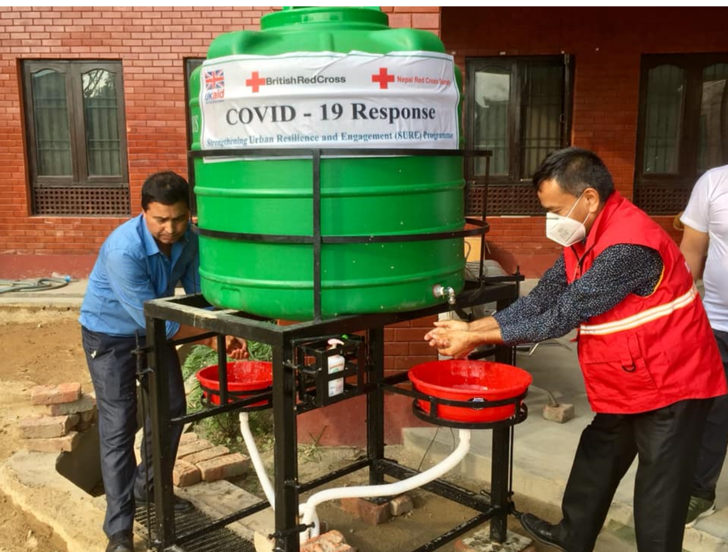
Nepal Red Cross

□ The IFRC is strongly committed to rebuilding infrastructures that last beyond emergencies and to being present throughout the ‘resilience continuum’. We therefore encourage our National Societies to scale up and institutionalize hand hygiene facilities in order to control public health emergencies such as COVID-19 but also to eradicate waterborne diseases like cholera. Handwashing with soap must be a priority now and in the future.