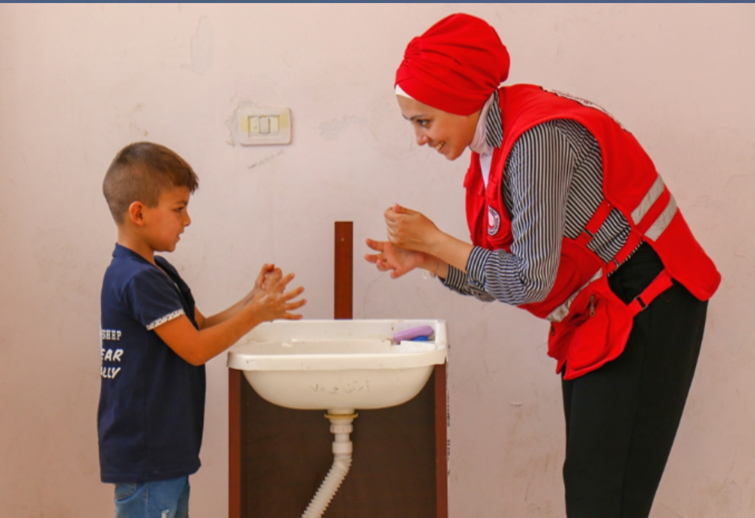
Syrian Arab Red Crescent

□ The IFRC is strongly committed to rebuilding infrastructures that last beyond emergencies and to being present throughout the ‘resilience continuum’. We therefore encourage our National Societies to scale up and institutionalize hand hygiene facilities in order to control public health emergencies such as COVID-19 but also to eradicate waterborne diseases like cholera. Handwashing with soap must be a priority now and in the future.