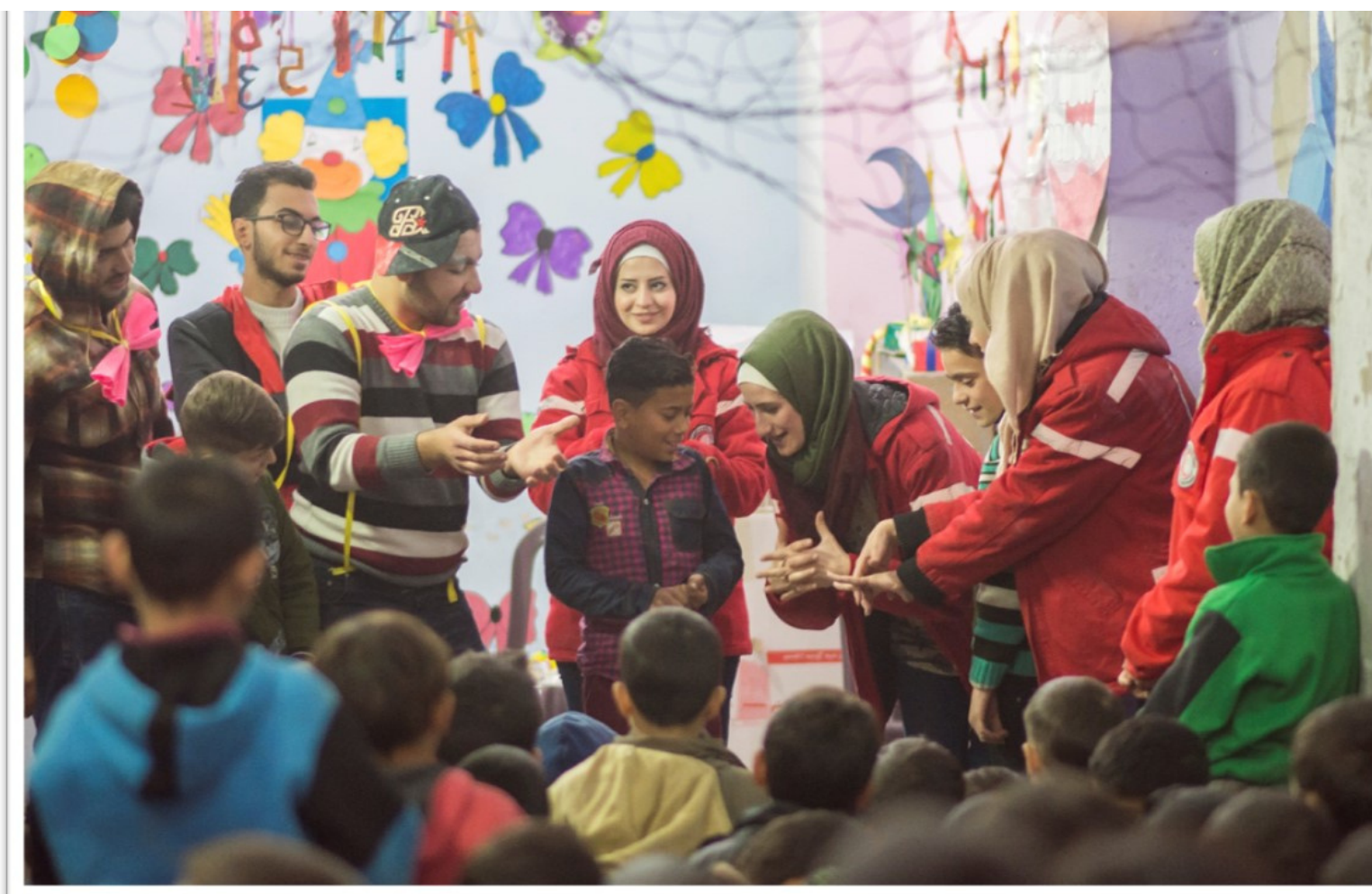
Syrian Arab Red Crescent

□ In order to respond to the immediate pandemic, our National Societies have significantly increased the spread of their health awareness campaigns and hygiene promotion activities. We are proud to share that more than 78 million people have benefitted from WASH activities since the outbreak of COVID-19!