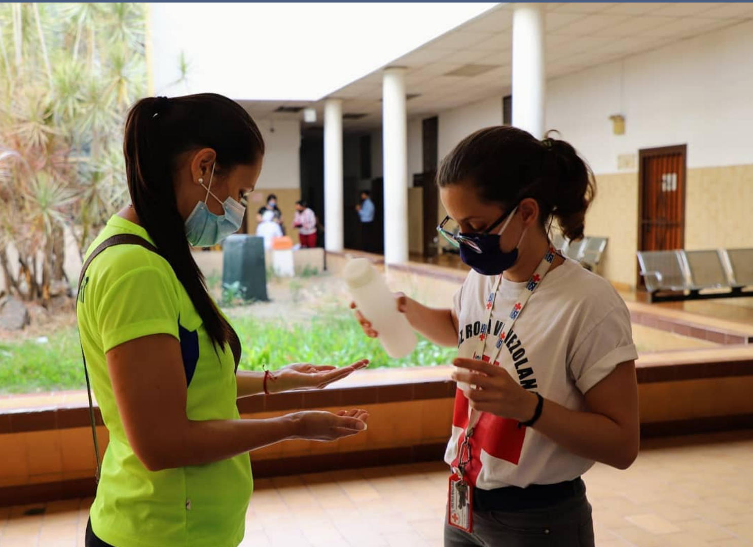
Venezuela Red Cross

□ In order to respond to the immediate pandemic, our National Societies have significantly increased the spread of their health awareness campaigns and hygiene promotion activities. We are proud to share that more than 78 million people have benefitted from WASH activities since the outbreak of COVID-19!