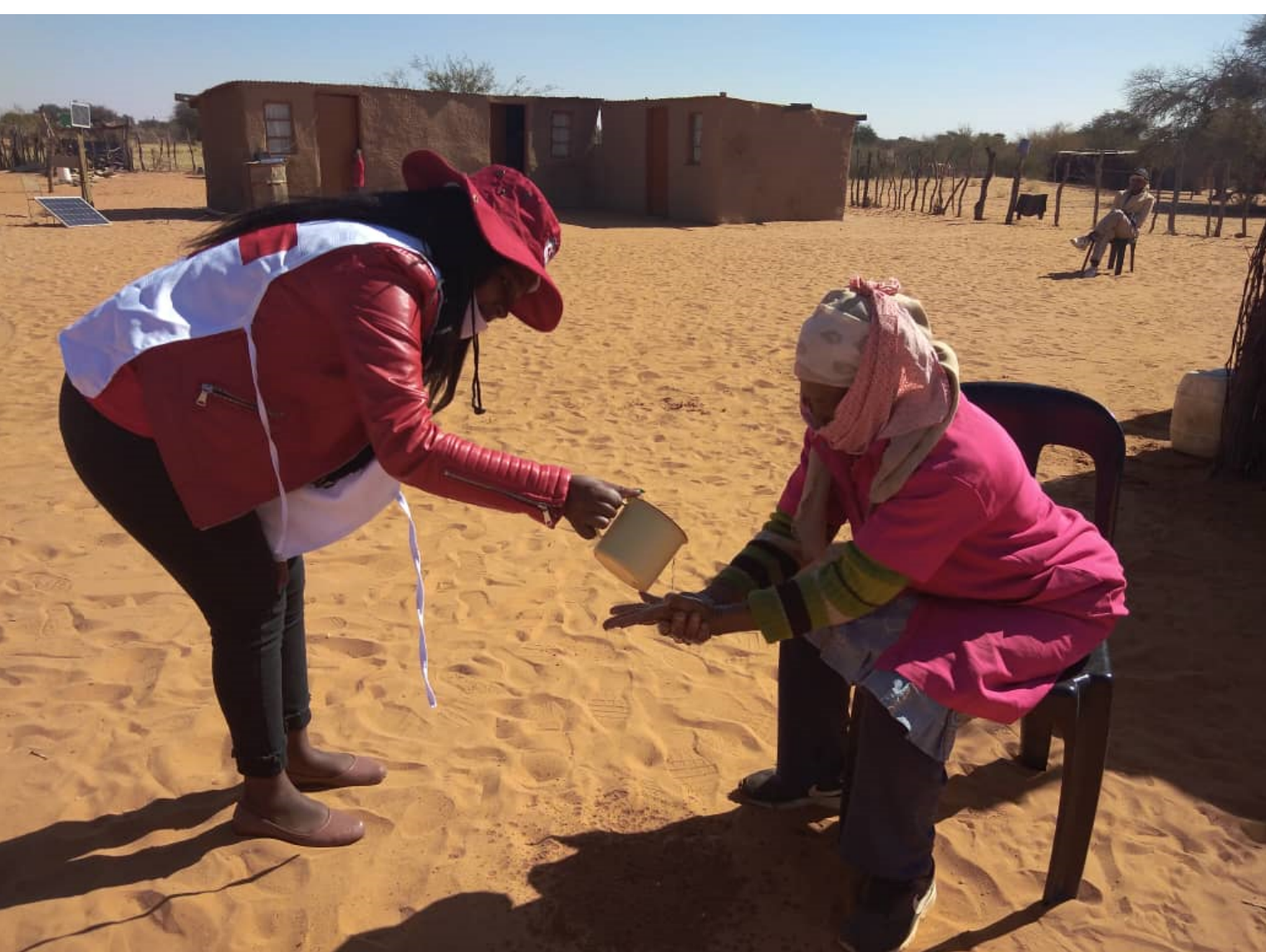
Botswana Red Cross