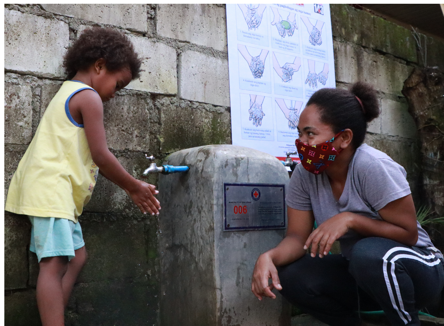
Philippines Red Cross