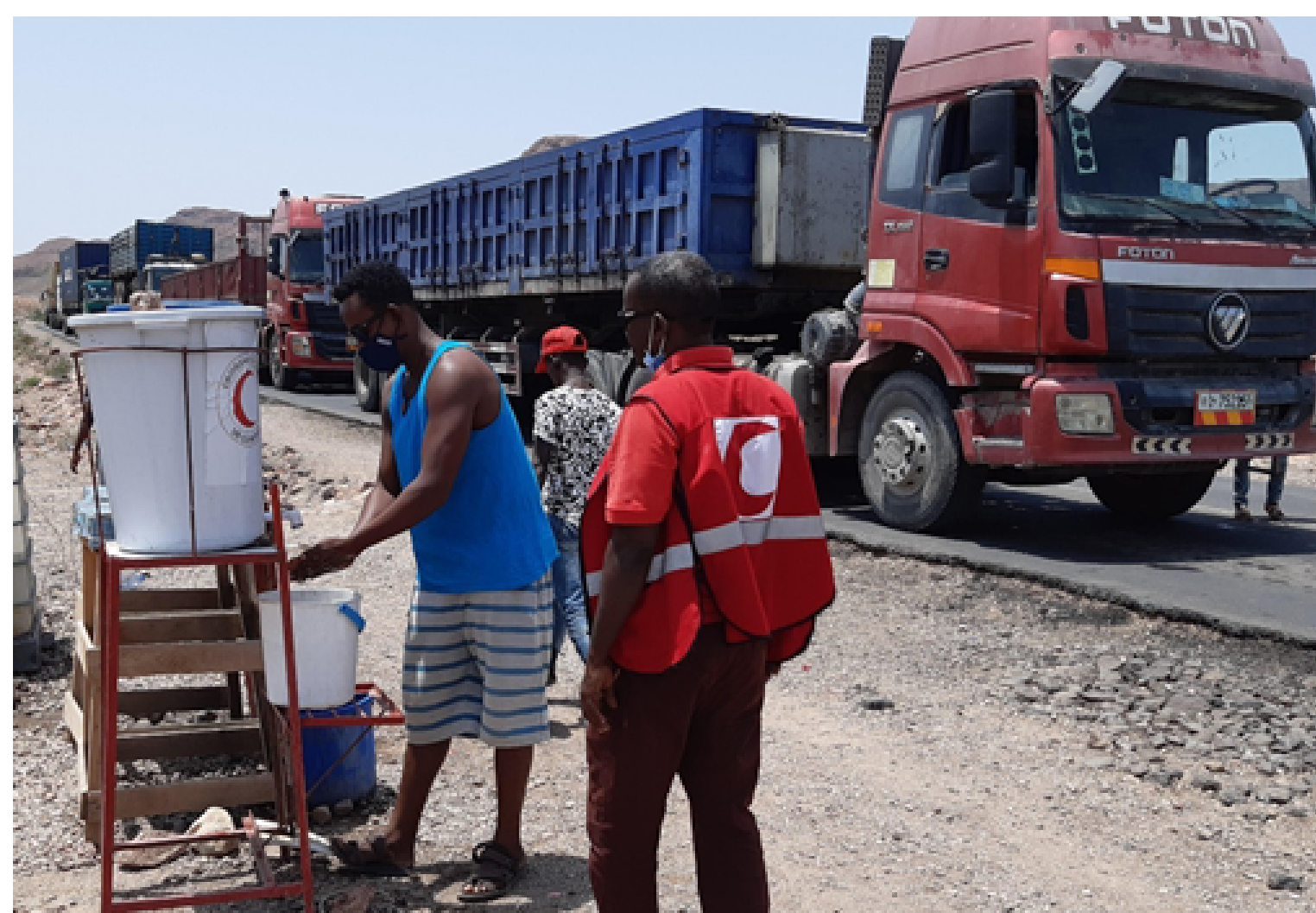
Djibouti Red Crescent