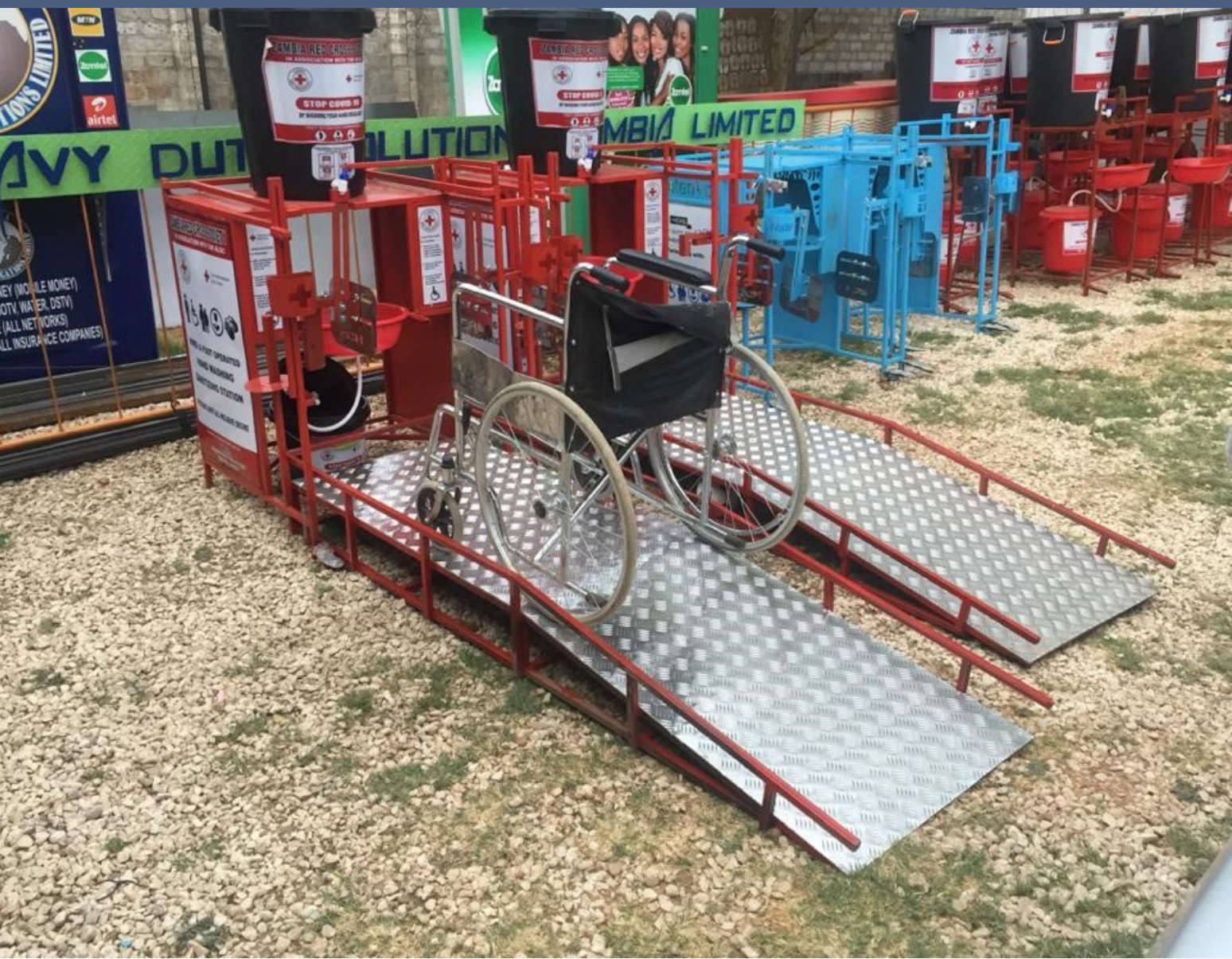
Zambia Red Cross