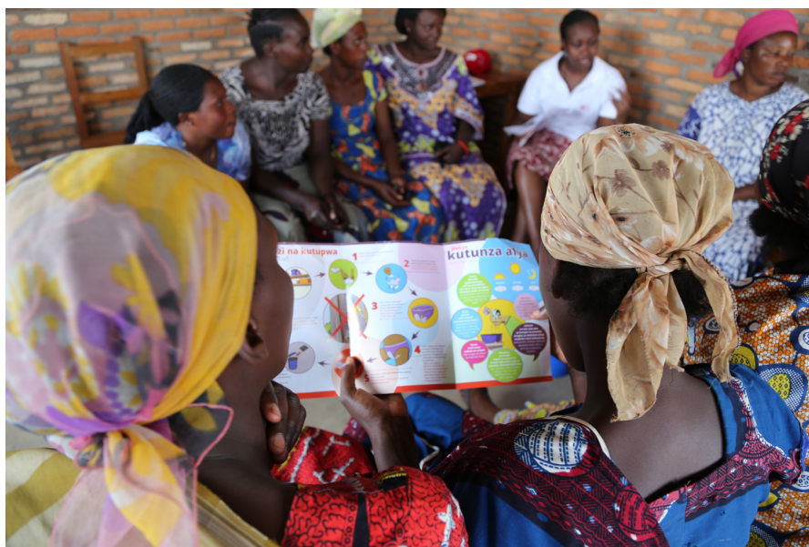
Women read the information brochure (included in each MHM Kit) during a focus group discussion in Bwagariza refugee camp; Burundi, 2013.