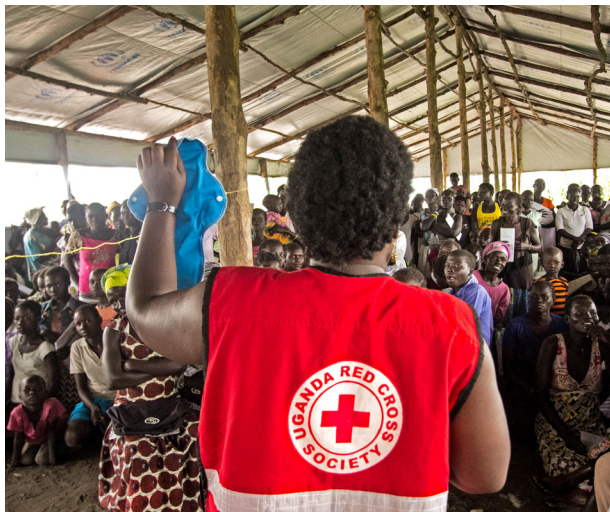
A Uganda Red Cross volunteer demonstrates how to use and care for reusable sanitary pads during the distribution of MHM Kits, Impevi refugee settlement, Uganda, 2017.

Addressing the menstrual hygiene needs of women and girls