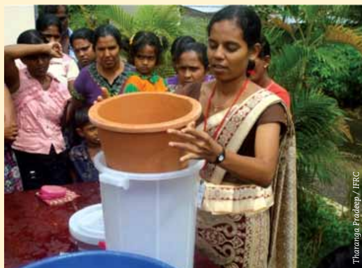
A Sri Lanka Red Cross Society volunteer conducting pre-distribution training on ceramic pot filter cleaning.