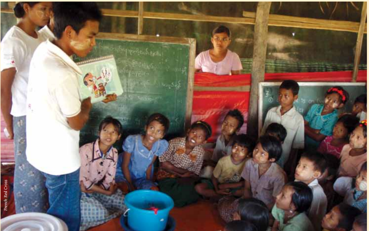
Myanmar Red Cross volunteer explaining the use of ceramic water filters as an alternative to traditional household water treatment practices.

Investing funds to establish a ceramic water filter production factory can continue to be a long-term source of income beyond the project period. Early in the tsunami project, Sri Lanka Red Cross Society carried out an in-depth study on drinking water needs, the National Society's and local capacity to produce filters, retail and wholesale margins and feedback from potential consumers. It took over two years to overcome many technical, practical and regulatory challenges in order to set up the factory and begin production. This included consulting with government agencies on quality and certification requirements – Sri Lanka Red Cross Society has their production process certified by a national research institute. Sri Lanka Red Cross Society now sells ceramic water filters through commercial retailers and has developed a new more attractive receptacle which can compete with other commercially available designs. Since 2010, 27,000 ceramic water filters have been sold to other organizations for subsidized distribution.