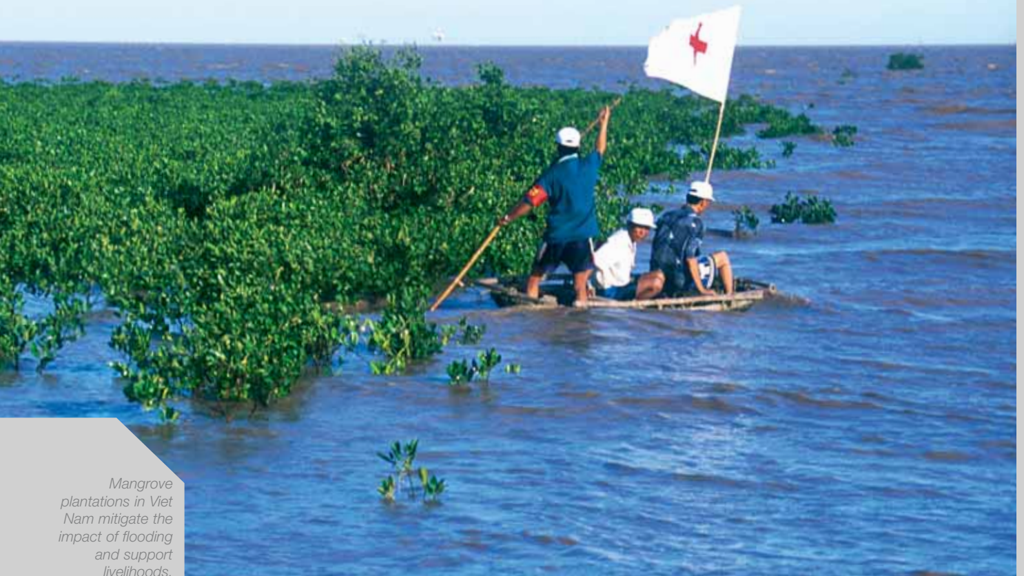
Mangrove plantations in Viet Nam mitigate the impact of flooding and support livelihoods.