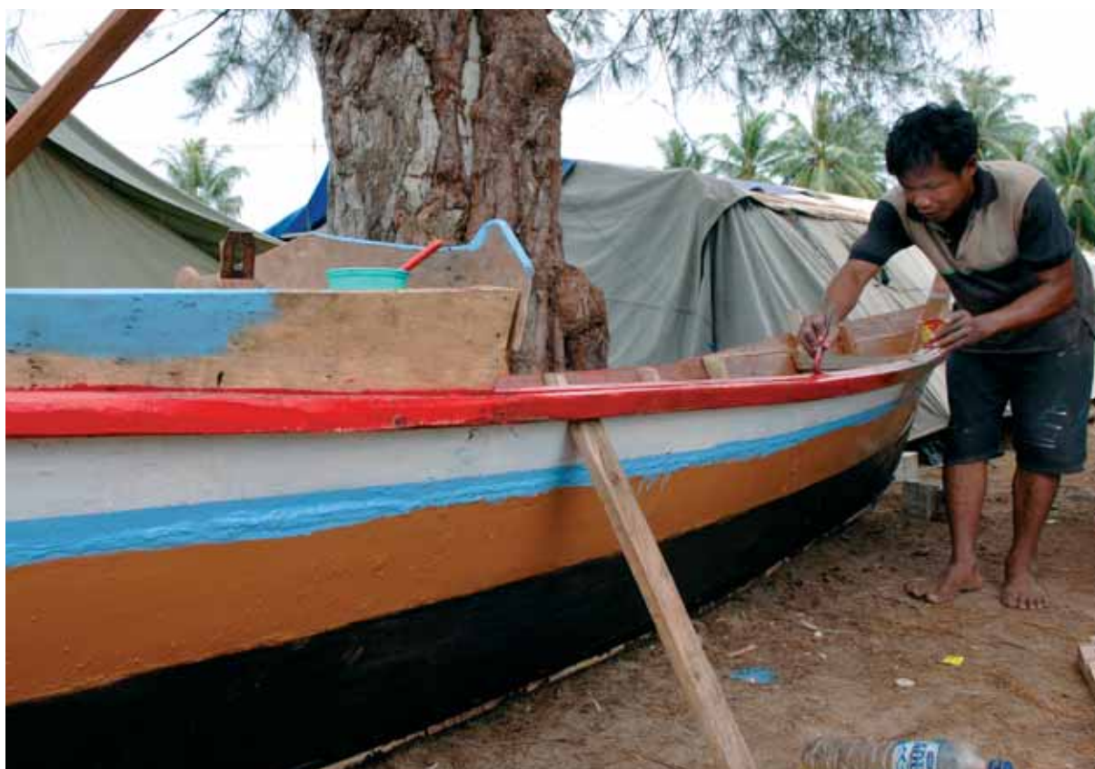
Restoring livelihoods was a priority in Indonesia to help recover from the tsunami.

In recent years there has been a growing recognition that strengthening resilience to disasters is not only about disaster management; a community / household with sustainable livelihoods, good levels of health care and access to a strong and accountable civil society is also better able to withstand hazards. However, it is important that these development gains are protected from disasters. Fully mainstreaming disaster risk reduction in to its development work, therefore, continues to remain a priority for the International Federation. The campaign while continuing to promote disaster preparedness and disaster mitigation, will take measures at all levels – governance, policy, management and practice – to mainstream disaster risk reduction.