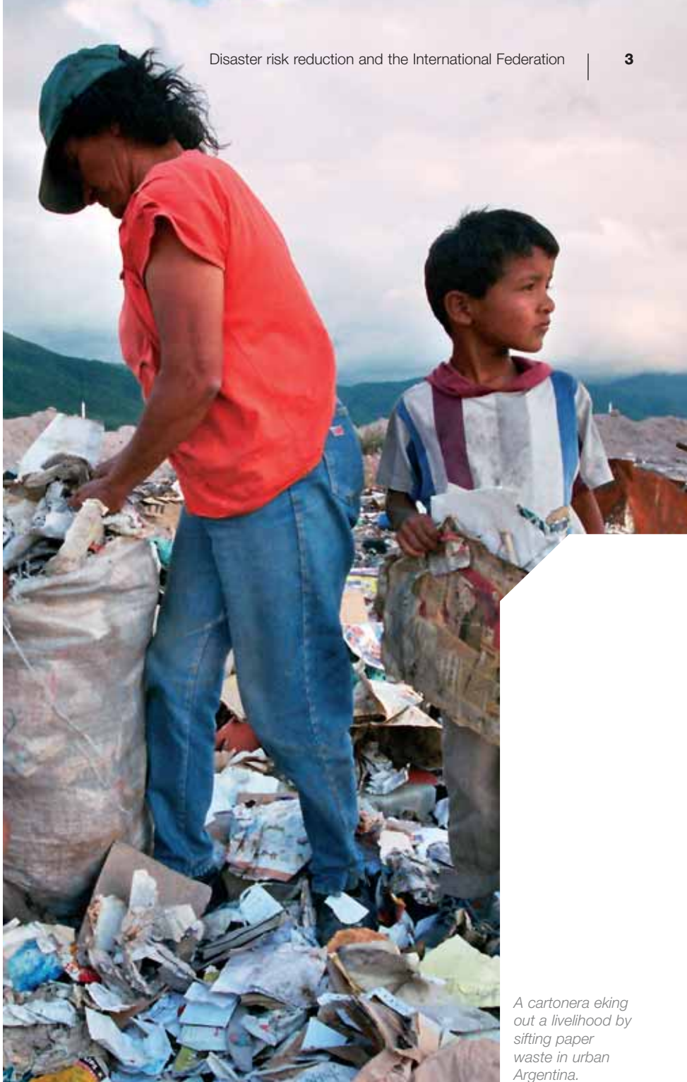
A cartonera eking out a livelihood by sifting paper waste in urban Argentina.

“Natural hazards are a part of life. But hazards only become disasters when people’s lives and livelihoods are swept away. The vulnerability of communities is growing due to human activities that lead to increased poverty, greater urban density, environmental degradation and climate change.”