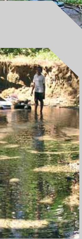
Community members clearing debris from a shared water source in the Solomon Islands.