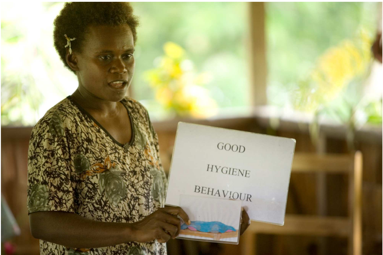
Health volunteers in Solomon Islands are trained to share information about hygiene with their communities.