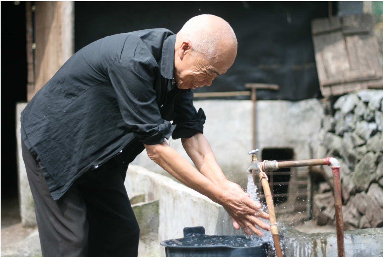
Villagers no longer have to walk all day to collect water in Longhe, China - they simply turn on a tap.