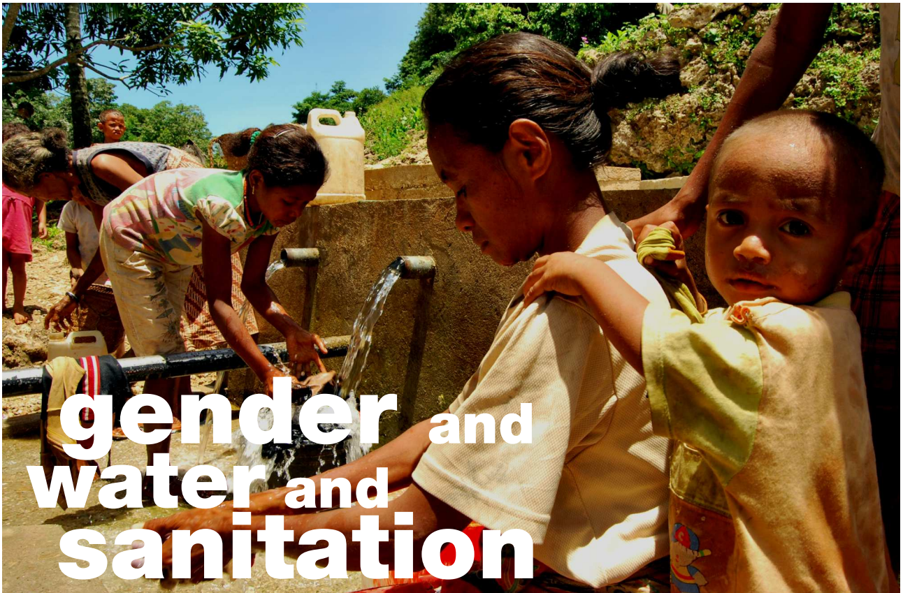
East Timor Red Cross is working with local volunteers to rehabilitate and protect water sources, construct family latrines, school toilets and hand-washing facilities.