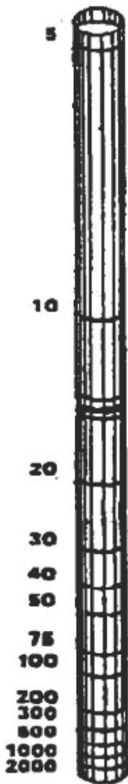
Figure 2. A turbidity tube

Since the turbidity tube is simple to use, instructions are given below. It is, however, recommended that you refer to the instructions provided with the tube that you are using. A turbidity tube is shown in Figure 2.